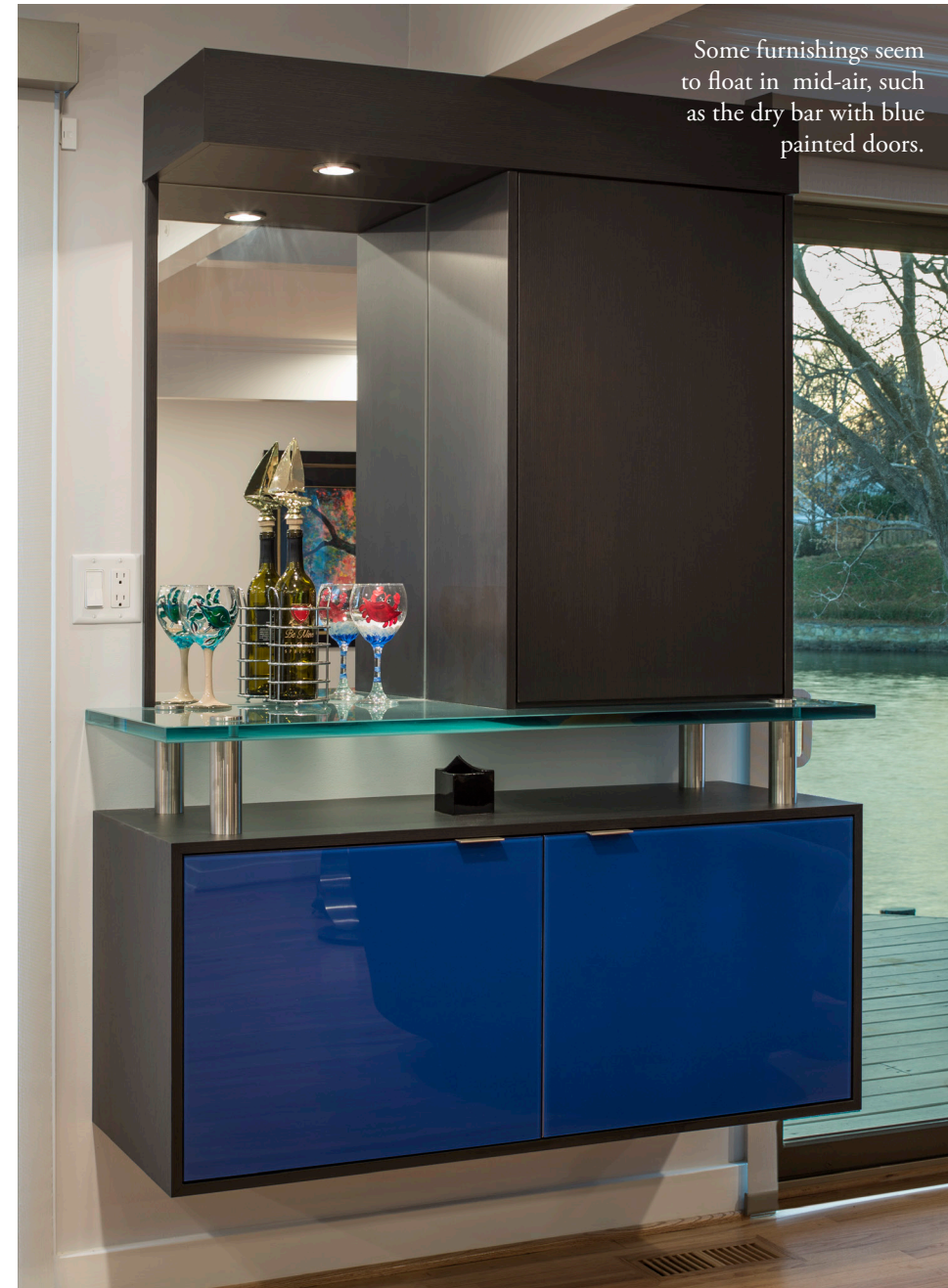
Some furnishings seem to float in mid-air, such as the dry bar with blue painted doors.