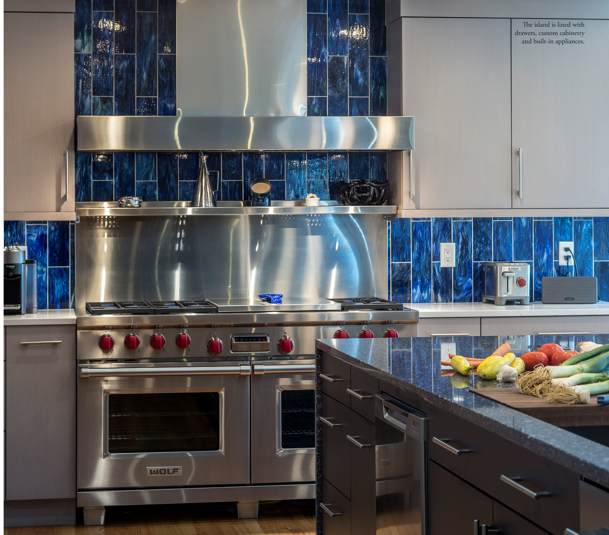
The island is lined with drawers, custom cabinetry and built-in appliances.

The countertops are Cambria, a quartz material in the Ella finish (the look of marble, yet more durable). The impressive island again uses Cambria but this is in the